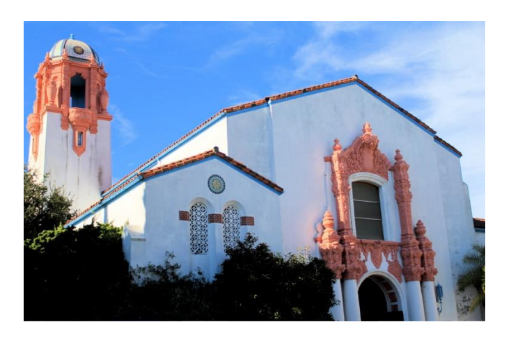
The donors who make it possible for us to create peace:

Total expenses: $38,795.56 Volunteer hours: 3,500, est.