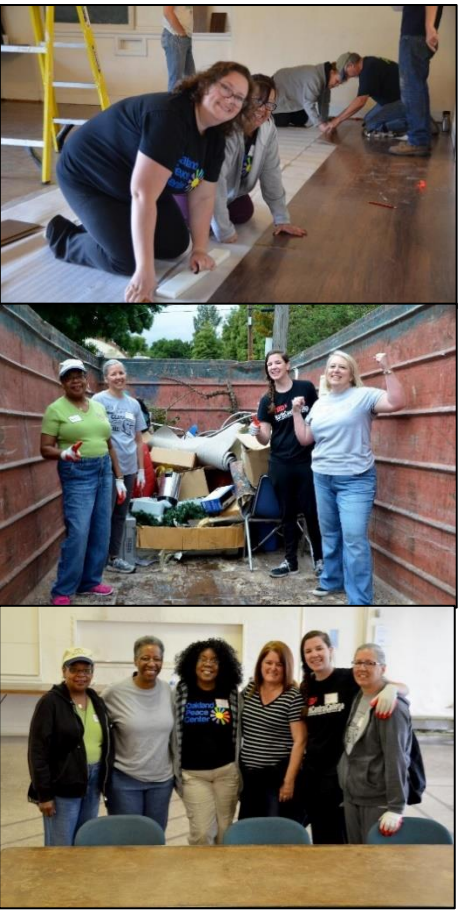
Where would we be without amazing volunteers?! In May 2016, 75 volunteers and 100 donors came together for a mini-Miracle Day where we did some serious building beautification!

The Oakland Peace Center is a community of artists, activists, cultural workers, educators and non-profits collaborating to bring about a city of hope, justice, nonviolence and compassion.